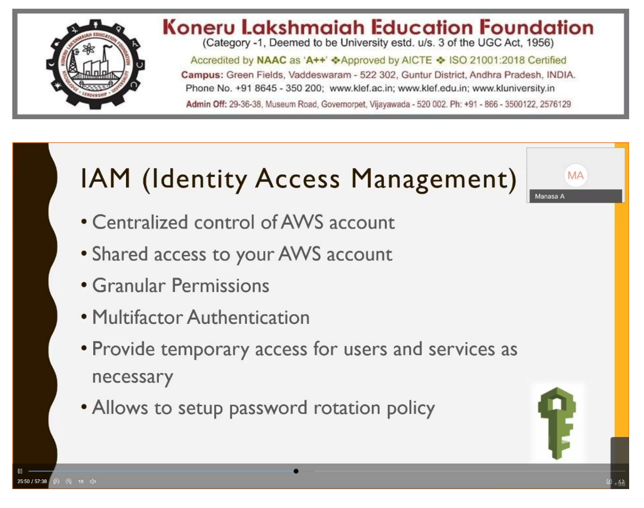
Fig. Snapshots of Webinar presentation